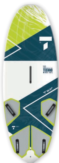
TECHNO WIND FOIL 130

Besides the exceptions outlined below, all WIND boards and accessories are identical in terms of shape, technology and features; when compared to the equivalent BIC Sport products from 2020. Only the graphics & branding change.