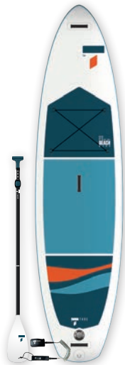
11'6 BEACH WING