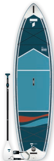
11'6 BEACH SUP-YAK

All other SUP boards are identical in terms of shape, technology and features, when compared to the equivalent BIC Sport products from 2020. Only the graphics & branding change.