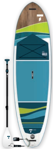
10'6 BREEZE PERFORMER