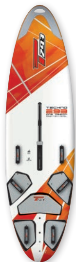
TECHNO 293 OD