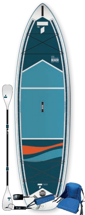
10'6 BEACH SUP-YAK

107252 SUP-YAK AIR 10'6 BEACH PACK vKAYAK