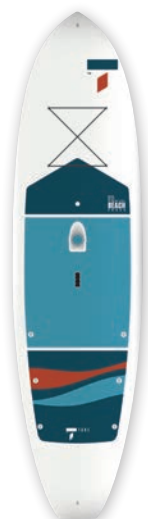
11'0 BEACH CROSS